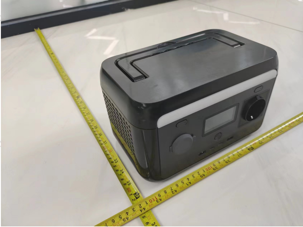
Fig.1 Overall view I of Battery