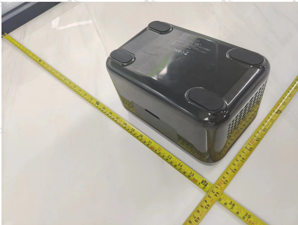
Fig.2 Overall view II of Battery