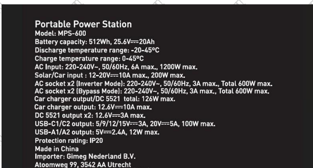
Figure 4 Battery Label