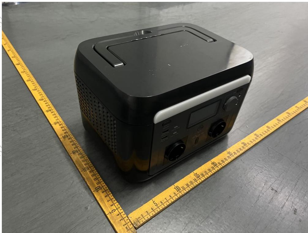
Fig.1 Overall view I of Battery