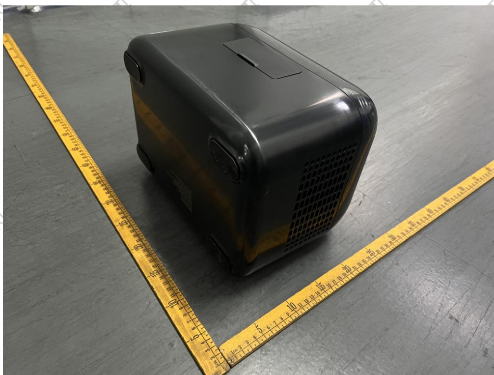
Fig.2 Overall view II of Battery