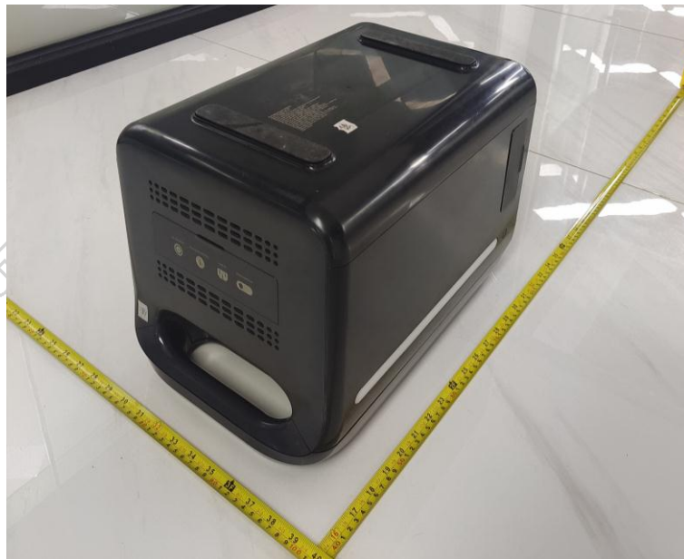
Fig.2 Overall view II of Battery