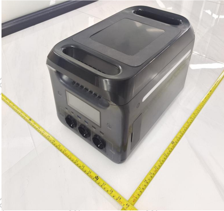
Fig.1 Overall view I of Battery